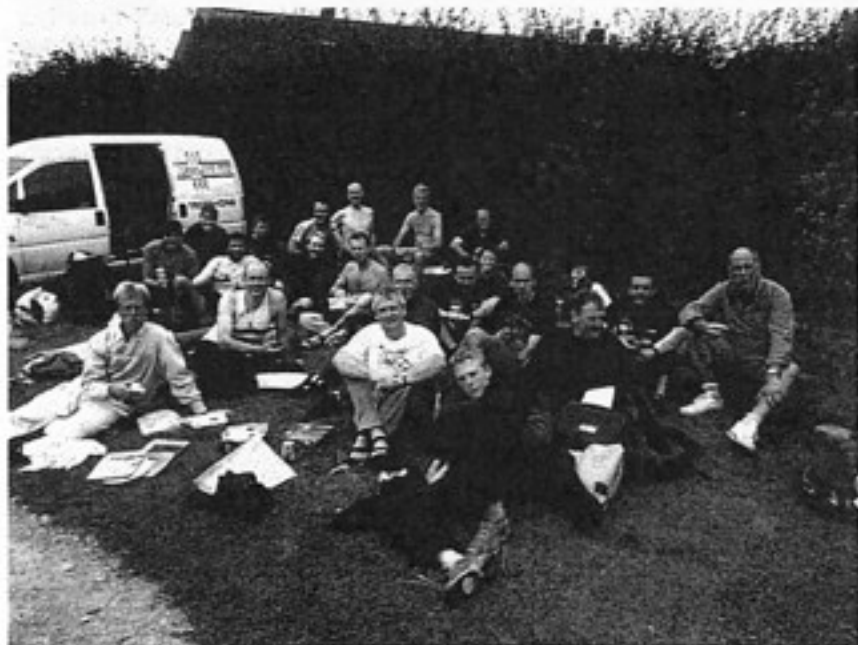
Survivors of the LIMM 2000